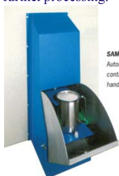
SAMPLE DISCHARGE Automatic discharge into a container in the simple-to-handle removal device

The HPCRMS150 is a flow through pulveriser capable of accepting up to 5kg of -10mm particle size material. The material is pulverized to 95%- 800 microns and a split portion of 500g to 1.5kg is presented to the operator for further processing.