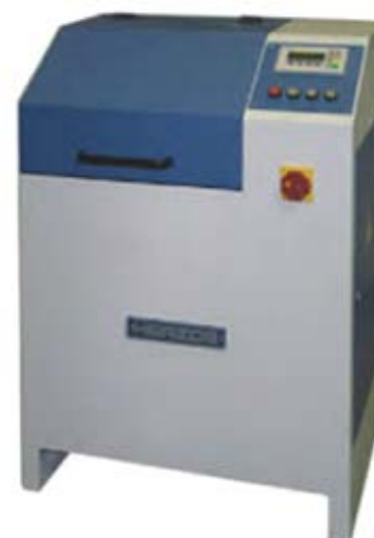
HSM100 H: manually operated clamping facility for the grinding vessels